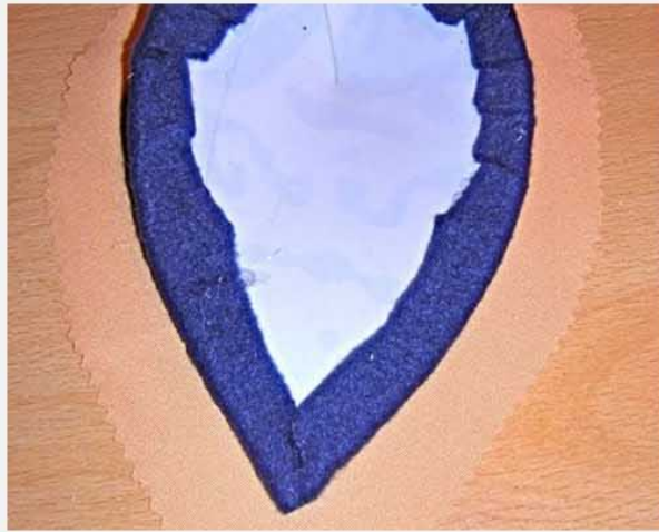
Step 4 of 13

Get your fashion fabric and lay it wrong side down with the felt side of the base facing down on top of it. Cut around the base, leaving an inch all around as before.