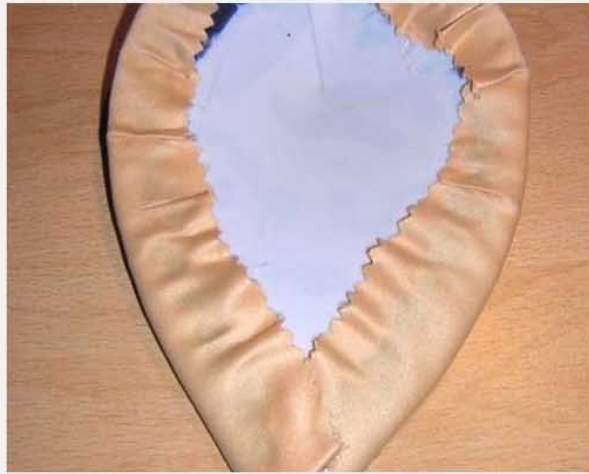
Step 7 of 13

Working your way up from the tip, glue the fashion fabric to the inside, making sure not to get any wrinkles on the good side. Around the curved edge you might need to clip the seam allowance to get a smooth fit.