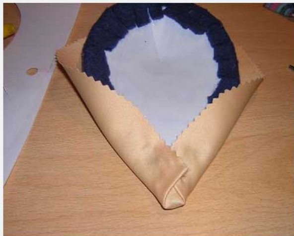
Step 6 of 13

Starting at the tip, put a tiny dot of glue on the very tip of the base and fold the fashion fabric up making a horizontal fold. Then fold the right side over and glue that onto the base as in the photo.