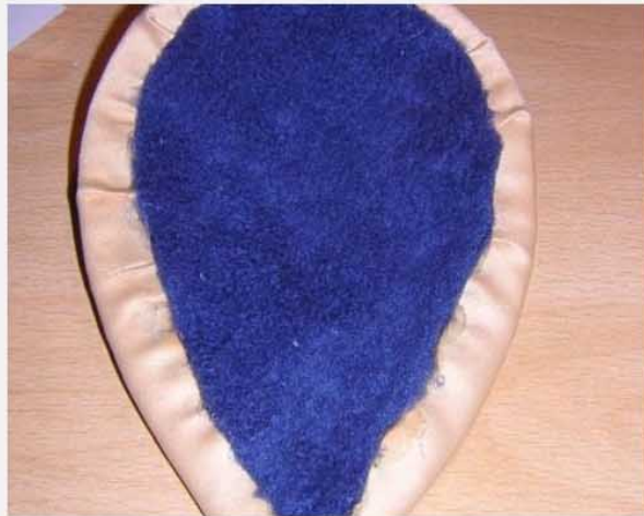
Step 8 of 13

Working your way up from the tip, glue the fashion fabric to the inside, making sure not to get any wrinkles on the good side. Around the curved edge you might need to clip the seam allowance to get a smooth fit.