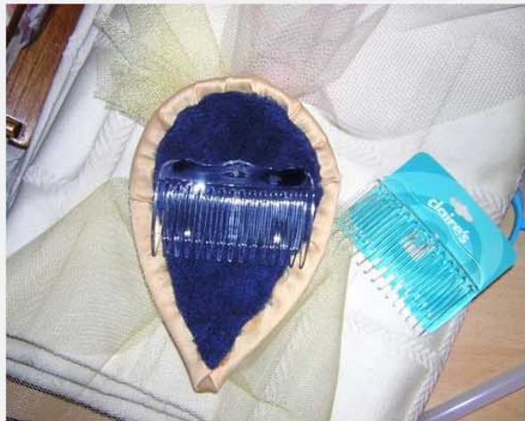
Step 9 of 13

Cut a piece of felt (or any other fabric) to be just big enough to cover the raw edges of your fashion fabric and glue it to the base, making sure it's affixed very well in the cupped area.